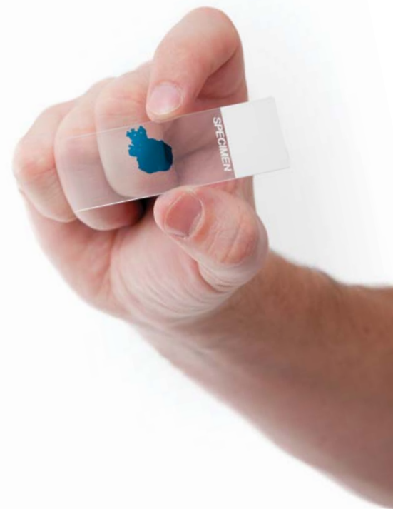
Custom Prototyping: Ligands can be custom tailored to increase specificity of binding, reducing the number of downstream steps required in production.

For more information about commercialisation contact the Massey Commercialisation Team phone (06) 356 9099 or visit www.massey.ac.nz/commercialisation